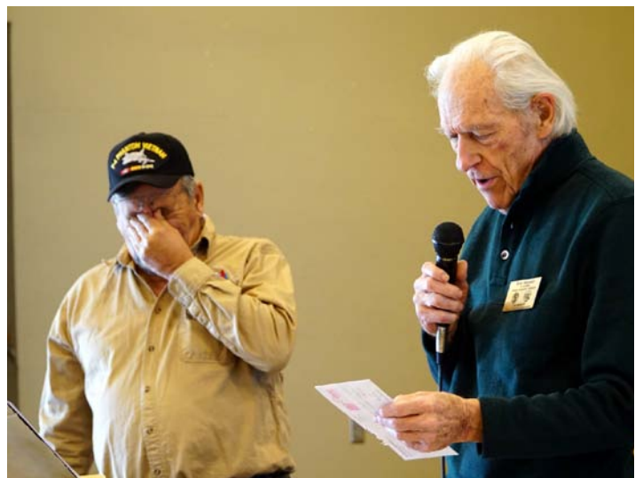
Yes, Mr. President it's budget time...