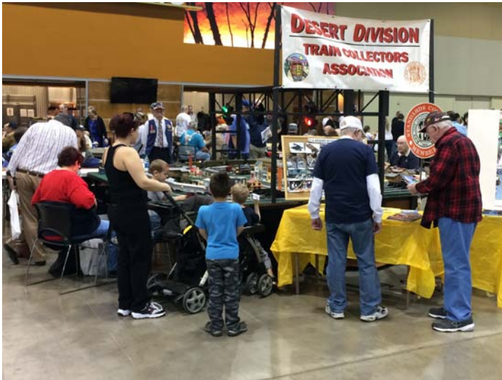
The real Super Bowl week-end and Desert Division was busy running trains at World's Greatest Hobby

If you follow the Division on facebook you may have seen some of these pictures. Desert Division at World's Greatest Hobby February 4 & 5 Phoenix Convention Center