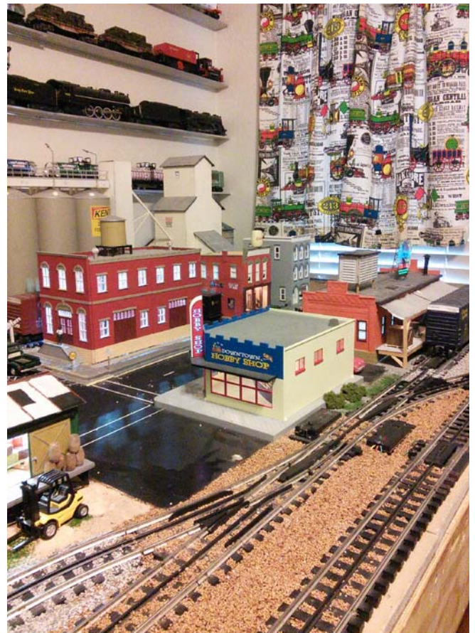
Downtown is nice, clean and a very compact area that has some great interior detail in many buildings