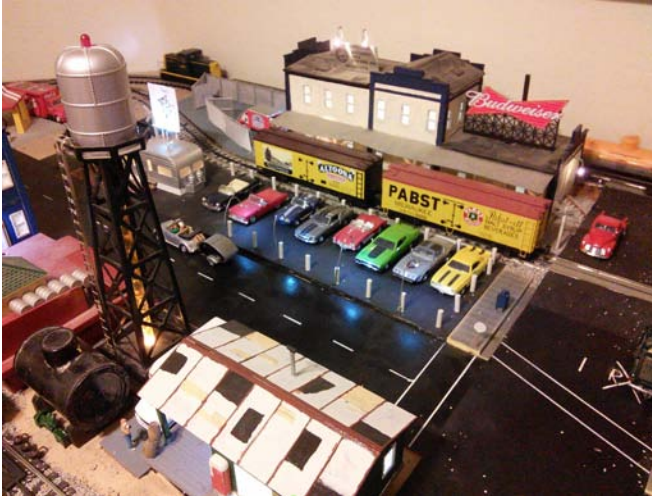
Every layout needs a Used Car Lot and Dave's has some nice muscle car action going on