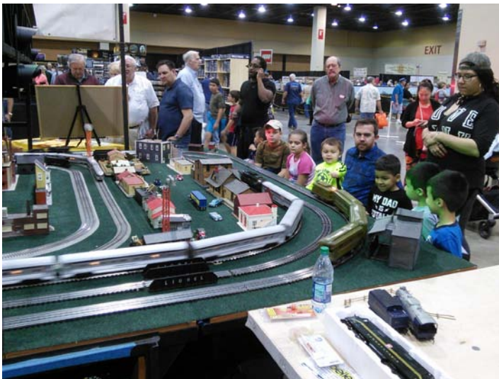
We had the families and kids right up to the edge of the module with very few mishaps all weekend long