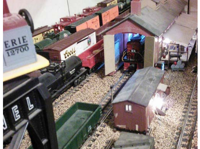
The engine house and maintenance yard highlights Dave's utilization of L.E.D. Lighting