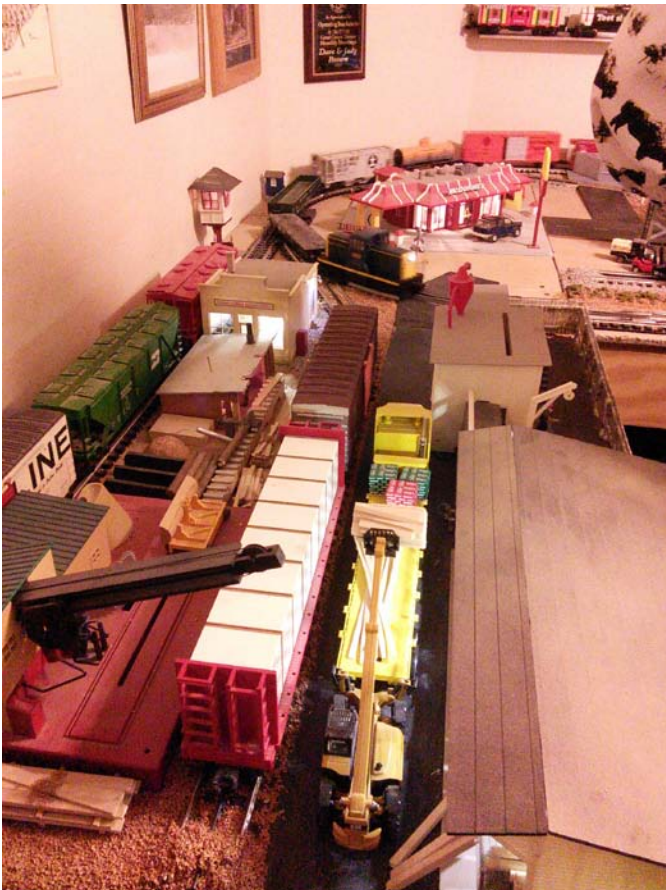
The industrial area has a lot of operating accessories some of them modified with LED lighting as well