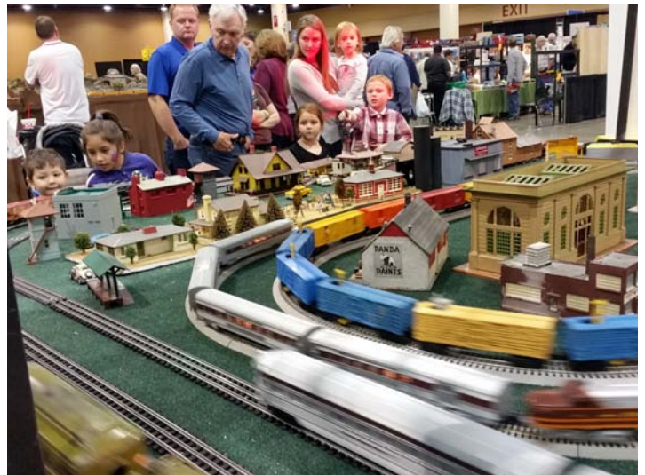
Hard to get all the trains in one frame. The Lionel 8, the Williams EP5 and postwar Lionel and Flyer ran great

Get Your Caboose to The 63rd TCA National Convention