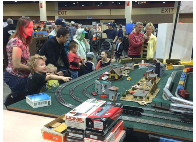
The crowd was around the module trailer all weekend long. We also had information of TCA, the Division and other clubs in town