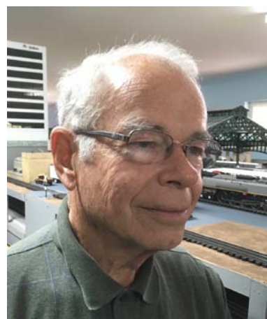
TCA Vice President