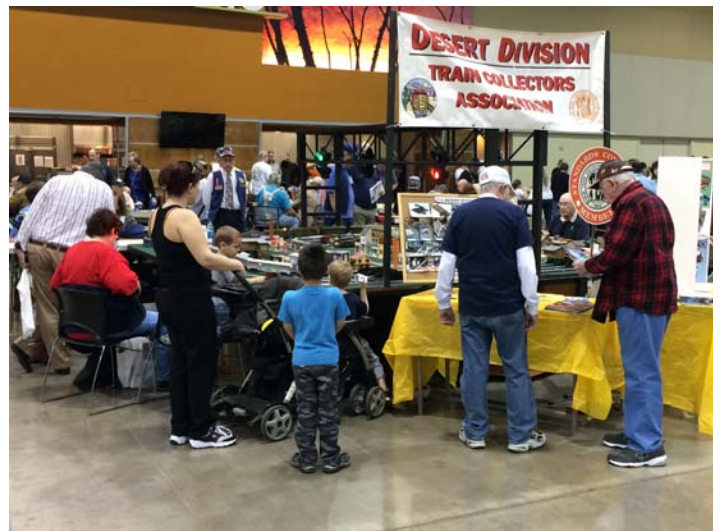
The "front of the layout with the Desert Division banner and photo poster board of how the trailer was built