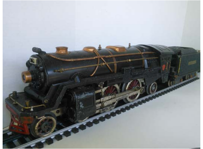
The 392 waiting for some new wheels and a little TLC. I know she will clean up real nice for the 85 year old beauty she is

second owner of this locomotive makes it special to me. Will I run it once it is repaired? Yes, the only reason he stopped running it was because the wheels had deteriorated so bad. In fact I am looking forward to the day I do bring it back "out of the basement" to be run again. I think that would be the best tribute I could give it and the memory of this friend and the times we shared.