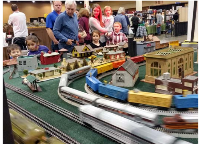
A little bit of everything in this photo, S Gauge, 027, Scale O and Standard all whirring around the layout