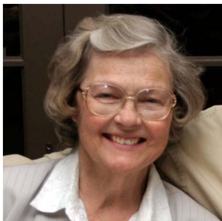
TCA National Secretary

That's right, by now you should have received you TCA National Headquarter News which contains your ballot and the names of two Division members running for national office. Make sure you voice is heard. Fill out your ballot and return it promptly.