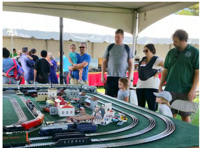
The trains ran all weekend to the delight of the kids and their parents and in some cases grandparents