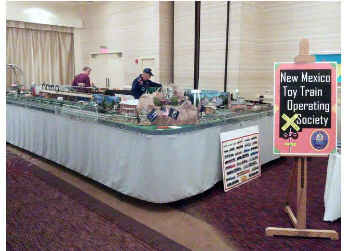
One of the numerous layouts in the room, this one is done by the TTOS New Mexico Division