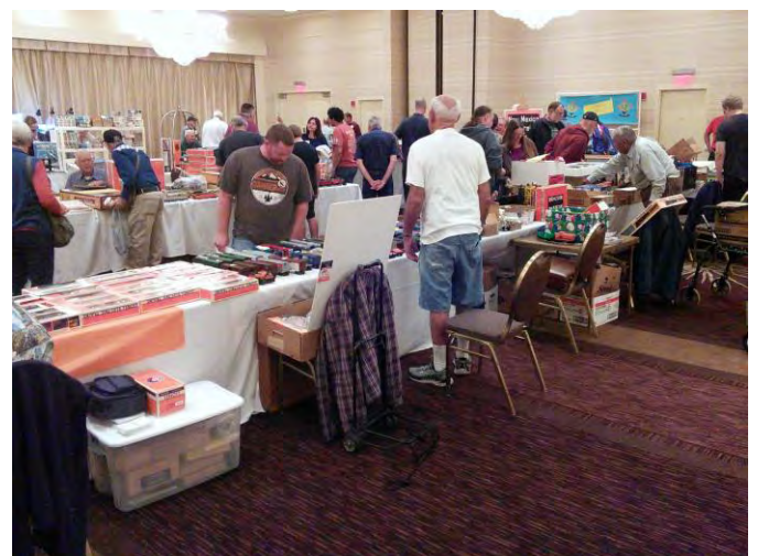
Once the doors opened the public came in steadily all day. Sales were brisk at many tables as bargains were snapped up by the public