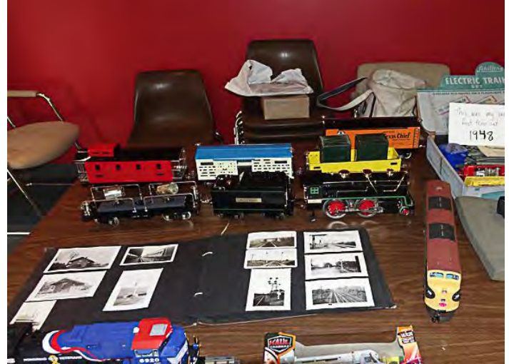
We had a wide assortment of items to talk about during the Educational segment. Now it's your turn.

HAVE YOU ORDERED YOUR TCA CONVENTION CARS YET? THE DEADLINE IS OCTOBER 31 ST . DON'T DELAY!