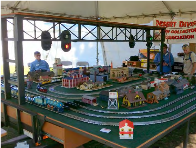
Saturday morning setup had Jon Hinderer's Blue Comet rolling around on the Standard Gauge loop