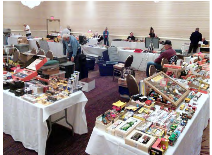
Dealers were still unpacking when this photo was taken showing about 1/3 of the over 50 sales tables sold for the show, trains in every gauge and condition