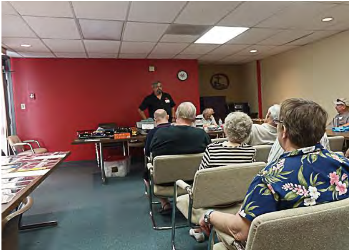
It's like having a meeting aboard an airliner, narrow and long we managed to get it done with high spirits and our "can do" attitude