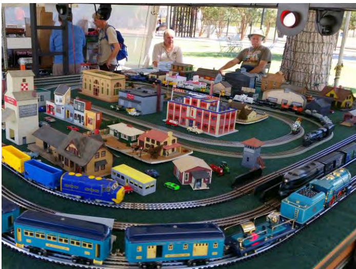
Jon's Blue Comet was quite the show stopper on the layout. No match for Chuggington's Brewster trying to overtake him on the inside loop