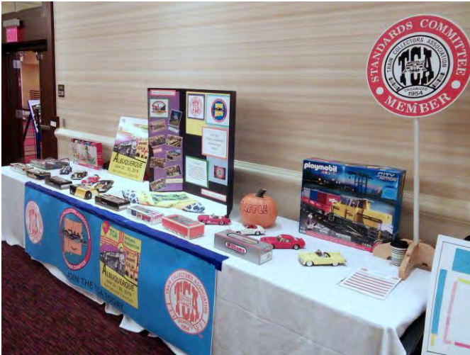
The front table had a nice assortment of raffle prizes along with information about joining TCA and the upcoming 2019 Convention