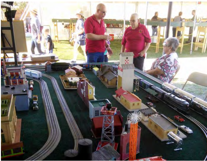
Many thanks goes to the Paradise & Pacific guys for helping out or just stopping by for a chat