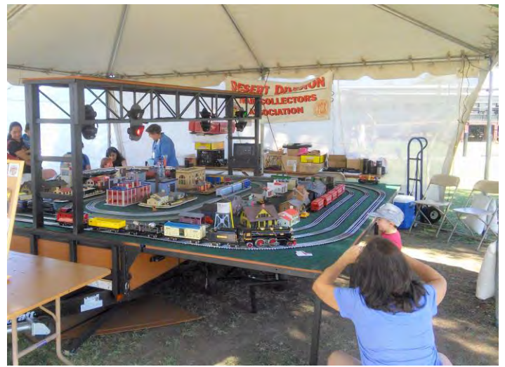
The trailer is just the right height for Mom to get those perfect pictures of her little engineer