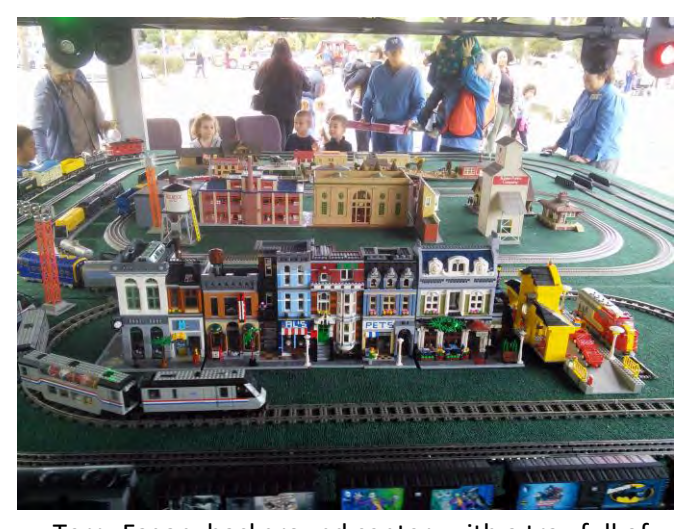
Terry Fagan, background center, with a tray full of diecast cars for the preschoolers to choose from

Desert Division participated in the second "Transportation Day" of the early new year, this time running trains at Shepherd of the Valley preschool. We again set up the trailer module on a untypical cool Phoenix morning following a brief rainy day Arriving at 8:00 AM members Terry and Jan Fagan along with Janet Mattern helped to get the trailer module unfolded and level. Once that was done we quickly setup a few pre-fab Plasticville layout plots and the Lego Train and city creations. By 9 AM we were running trains to the delight of a constant stream of children.