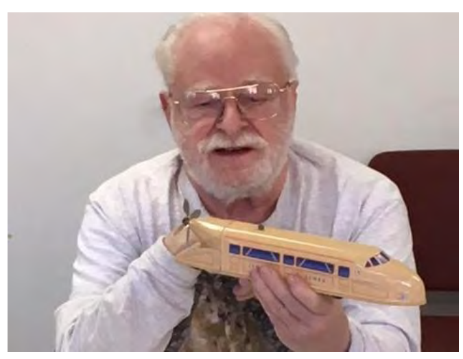
Jim Trever's Schylling Collectible Railcar Zepplin. Works as a floor train or on the track