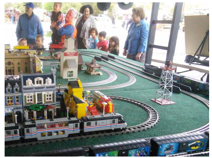
Two more pictures from Transportation Day at Shepherd of the Valley preschool. Simple setup makes running trains easy and fun for everyone.