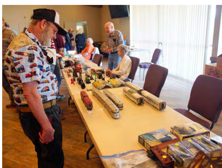
Tough to negotiate a sale when you're talking to an empty chair