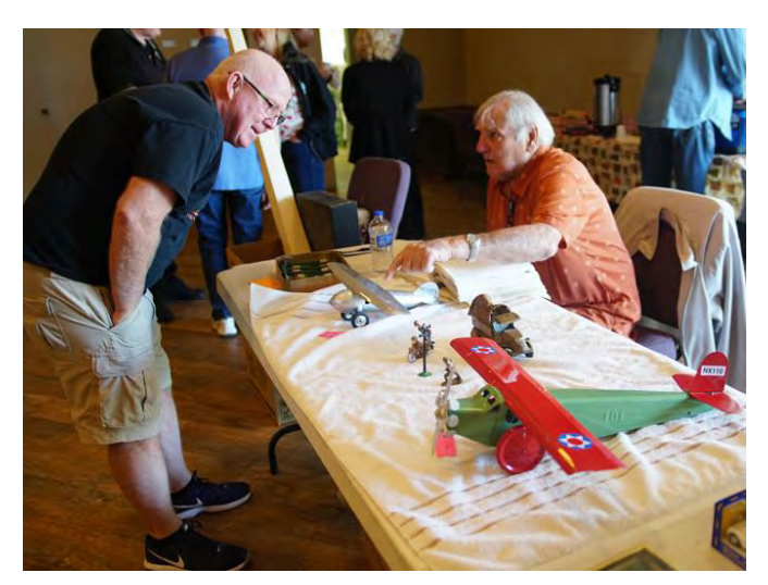
Looks like Les Gnatz has a prospective buyer

The move has also caused the shift for the November Train Auction . The Division has reserved Saturday November 17 <sup>th</sup> at Shepherd of the Valley Lutheran Church our usual meeting location. This year's auction is just about full of a nice selection of pre and postwar trains including many near current production items as well. Auction catalogs at set to go on sale over the summer as well.