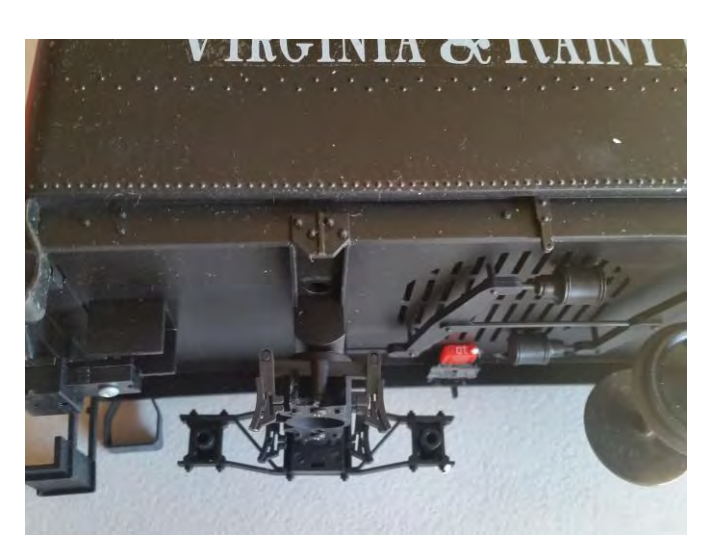
Although new in the box, the rear truck on the Spectrum Consolidation tender is broken and will need to be replaced