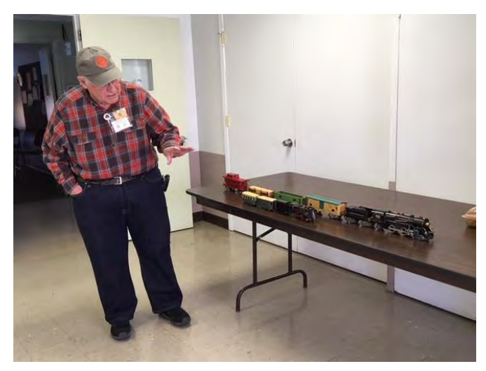
Greg Palmer's American Flyer prewar 1121 freight set In very nice condition