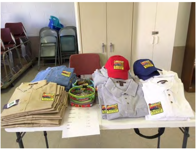
They are here! Get your official 2019 Convention shirts and hats. Contact Scott or Elaine Eckstein