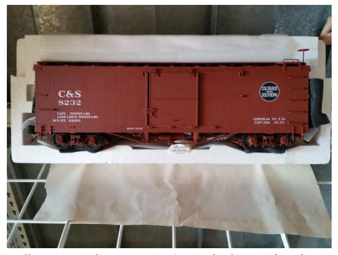
All AMS Freight Cars are mint in the box and scale G with very high detail