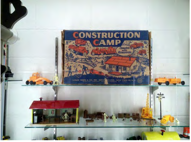
More from the NTTM Open House – Here are two more pictures from the huge Marx display