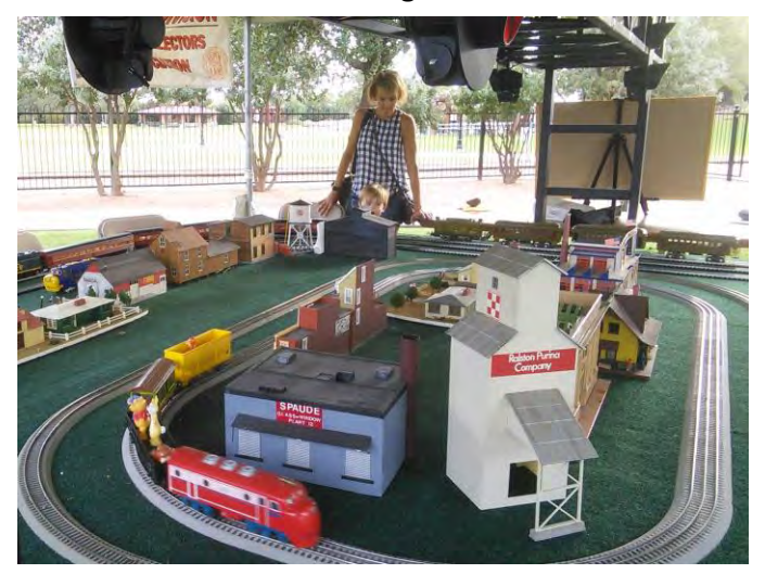
With the clouds moving in and the wind picking up the crowds began to thin in the afternoon, but not their enthusiasm or intensity to watch the trains