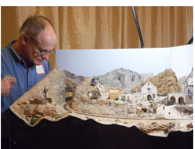
Making sure everything is running right on the N Gauge layout