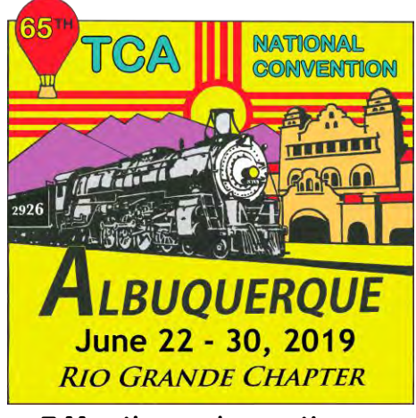
7 Months and counting...