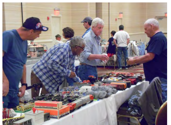
Another happy customer. Wide selection of every gauge and era on the tables