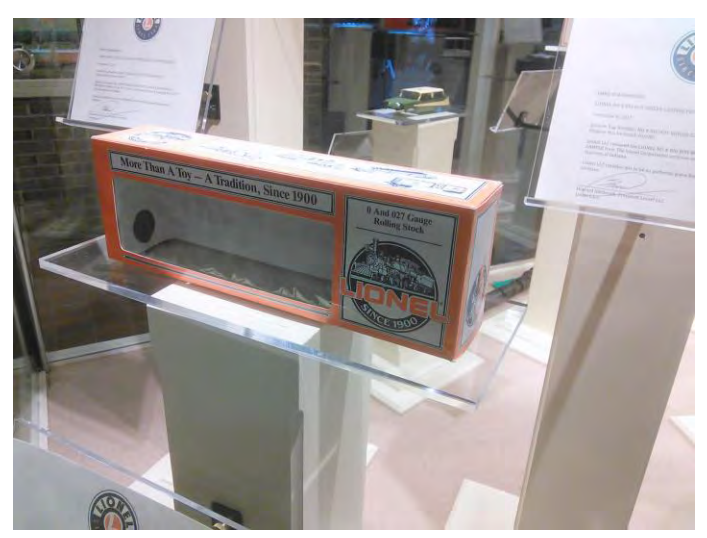
One of the rare items recently acquired and on display was this prototype of box that was never produced