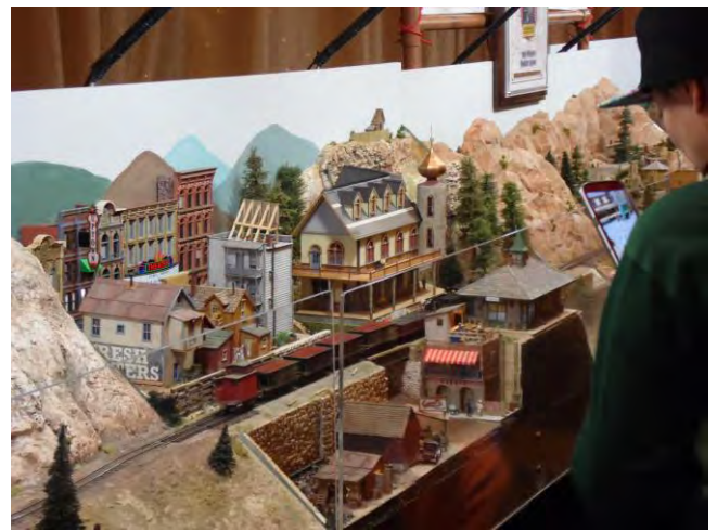
The attention to detail is what makes this layout standout. It will also be on display at the 2019 convention