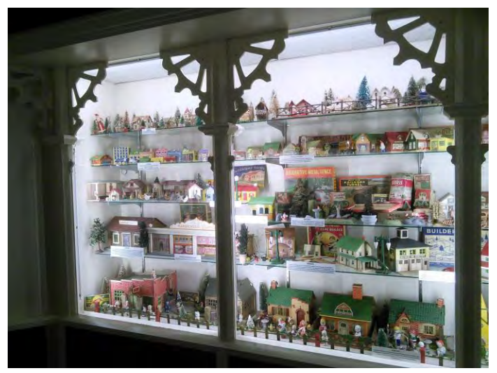
Nicley done display full of layout buildings both prewar and postwar