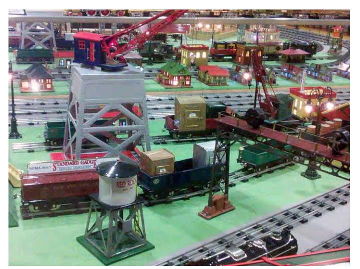
I love this scene that was created on the Standard Gauge layout that featured the 1997 Red Rock tower and 2009 MTH 212 gondola with containers