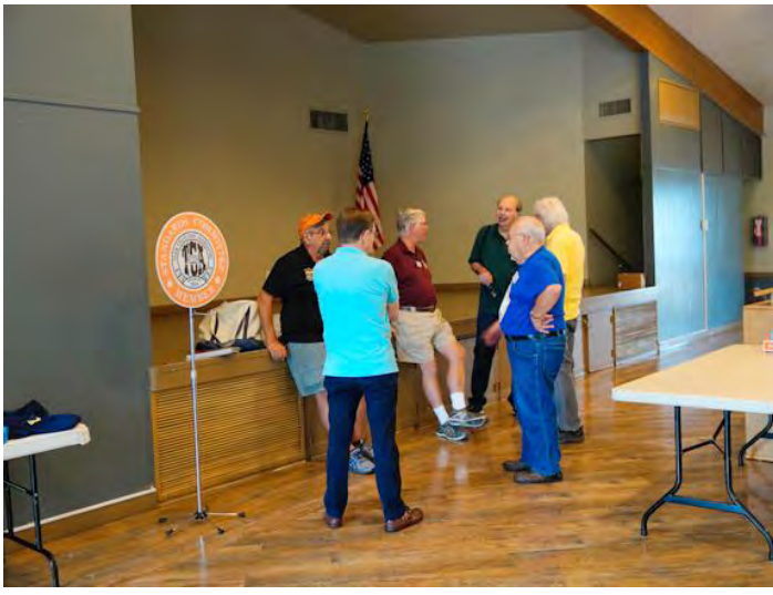
A roundtable discussion minus the table. Looks like everyone had a story to tell