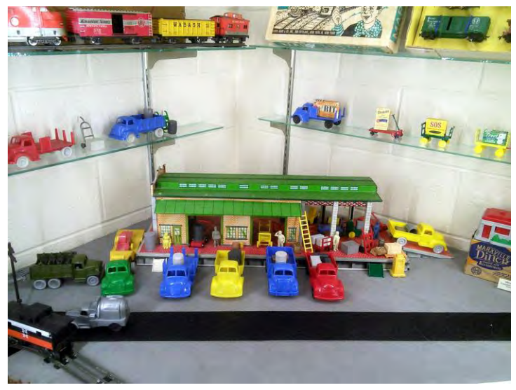
Both of these sets are rarely seen, even in broken sets, and to see them complete in one spot is a real treat