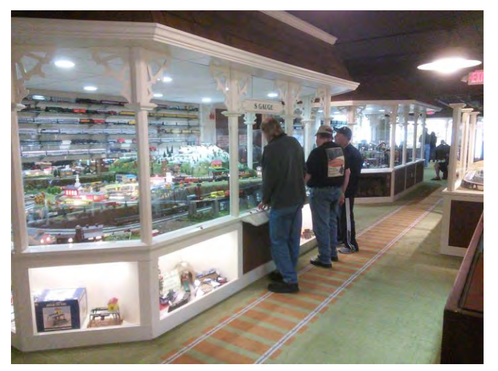
The large S Gauge layout at the National Toy Train Museum has space for additional display items