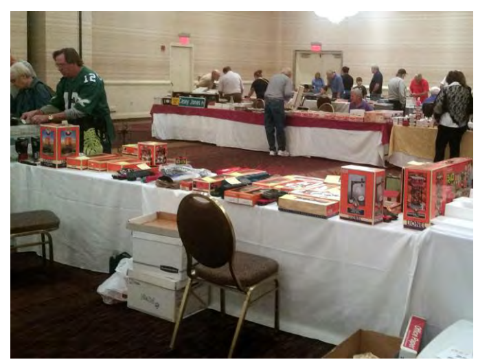
Just moments before the doors were opened to the public, vendors were still getting things "just right"