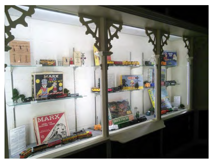
Several Marx Displays throughout the Museum this one featured many mint Marx set boxes