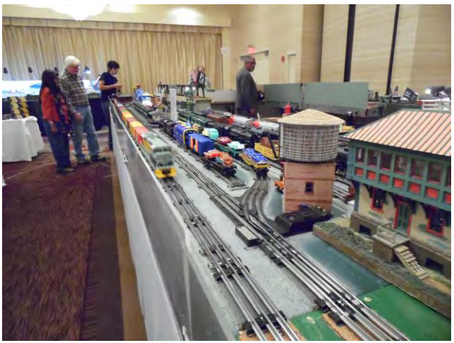
Looking down the long front mainline of the TTOS module