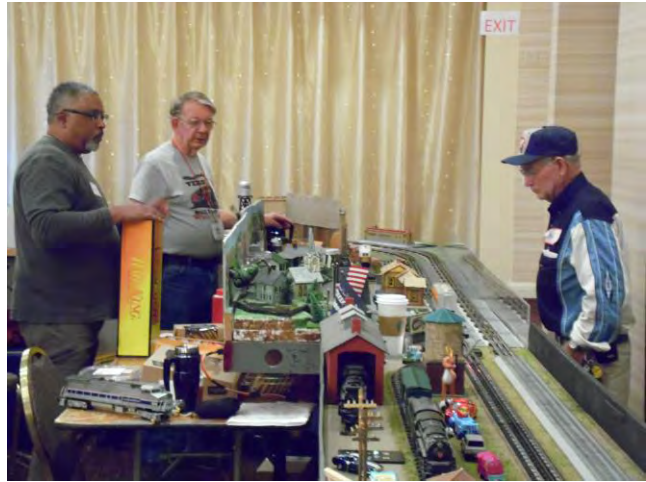
The "business" side of the TTOS module. It will be one of the featured layouts next year at the hotel