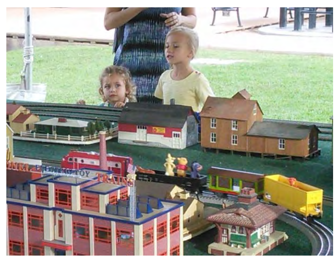
Yes, we like to play with trains, but the joy of sharing the fun with the next generation is fun as well.