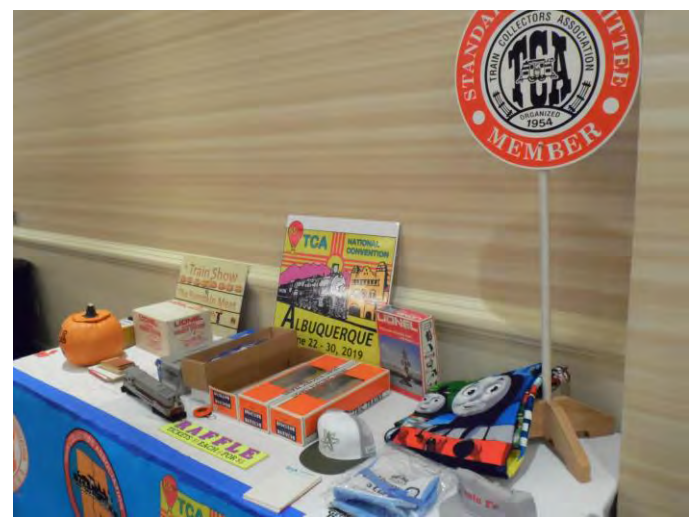
A table full of raffle prizes and a few of them found a new home in the Phoenix area