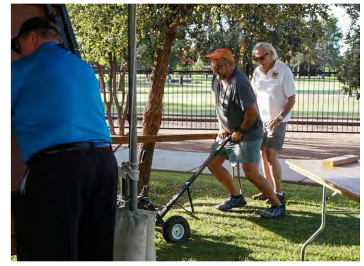
It was a real grunt moving the trailer into posistion. Flat tires on the trailer dolly didn't help!