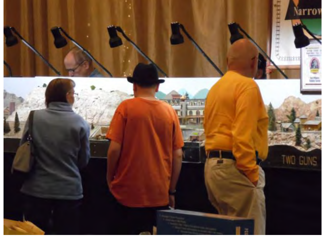
The New Mexico Narrow Gauge Railroad Club module was a hit with the public