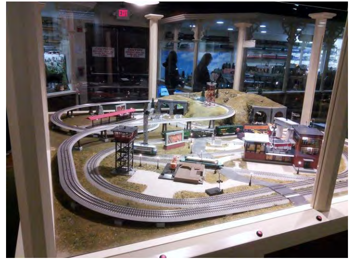
Very creative recreation of the Lionel D264 layout with pushbuttons to operate the accessories