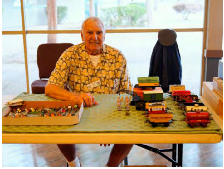
Les Gnatz came up from Maricopa with a nice assortment of items including some unique figures