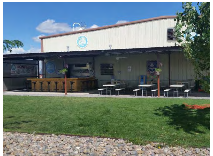
The back-patio area at Sierra Blanca Brewery. The grounds have trees and a covered trellis.