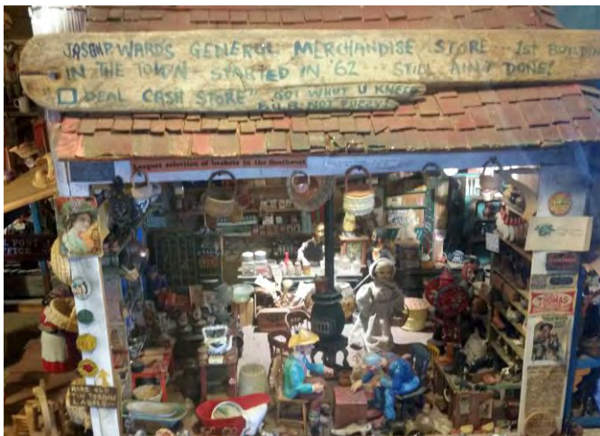
Lots of animatronics, homebrew style keeps Tinker Town quaint and entertaining