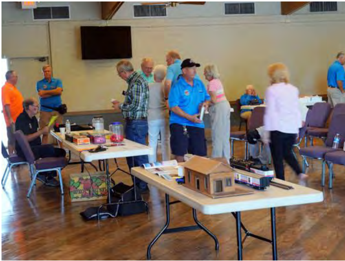
Welcome back from summer. The hall was busy all morning as we all got together again