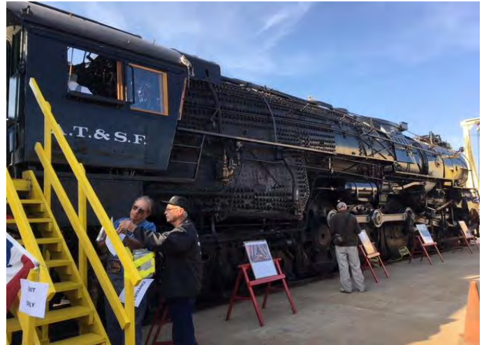
Setting up in the morning before the 2926 Open House in Albuquerque last month