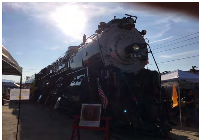
She is a real beauty and you can see her up close with a special behind the scenes tour next year