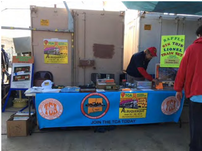
The Convention Committee had a table to promote the convention and membership in TCA and the Chapter