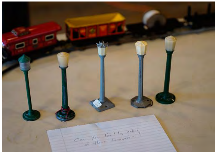
We didn't get a picture of Paul Wassermann talking about these different lamp posts but did get a picture of the wide variety he brought in