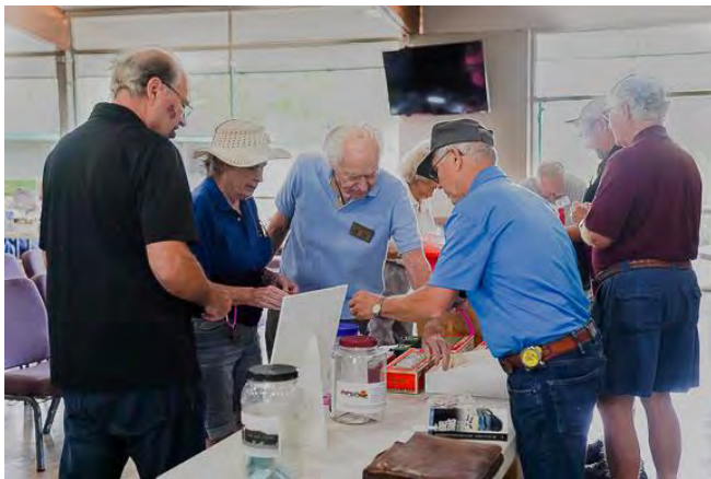
Seems like our members can't get their raffle tickets in the jar fast enough. Thank you all for your support!