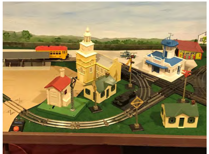
We liked the switching layout we saw last year at the Warwick convention, so Scott Eckstein built one for ours