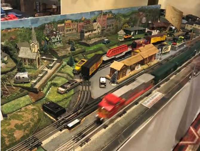
The TTOS New Mexico Division module has some very unique custom plots on their layout