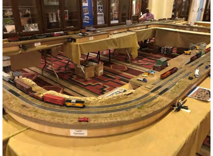
Another view of the NMRA Kids Club module. You can see the name tags of all the young members who built and maintain their own module section