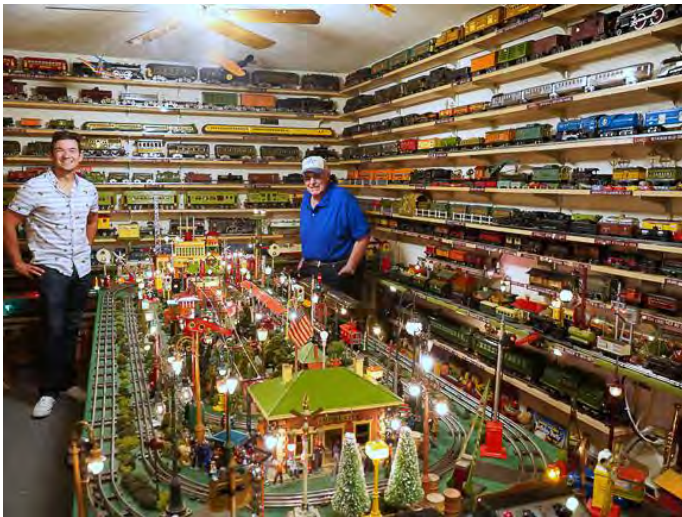
Greg Palmer's open house was a big hit with many of the collectors.