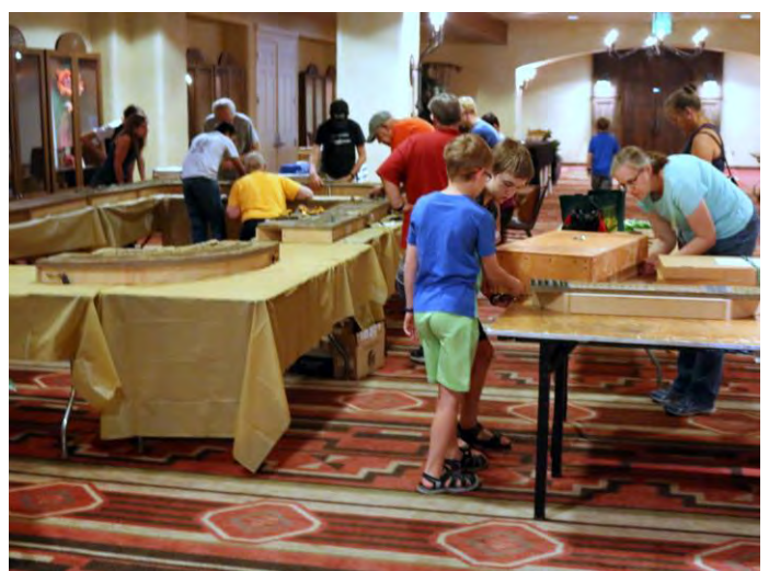
The future of the hobby? NMRA Kids Club setting up their modules, adult supervision only, kids did it all