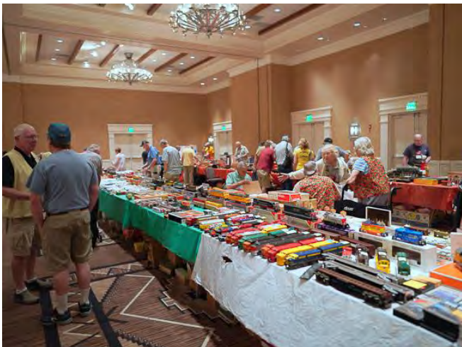
A small view of the trading pits where there were over 130 tables of treasures looking for a new home