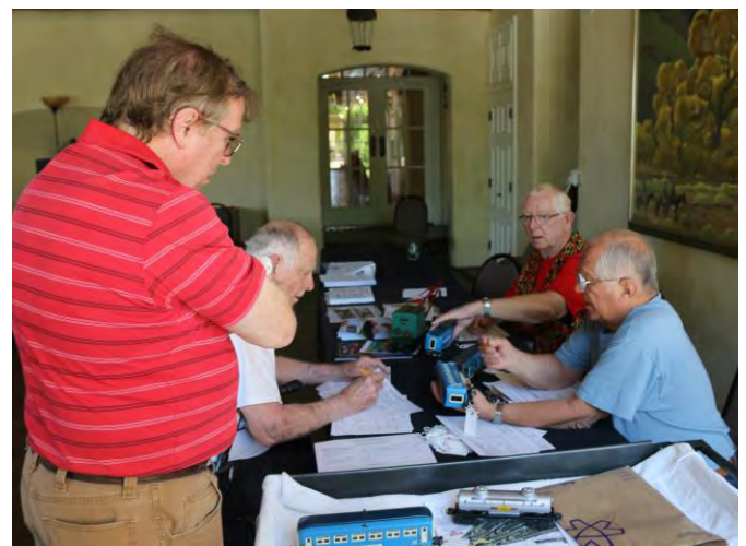
Yes, we had a restoration contest for the first time in many years at the TCA National Convention