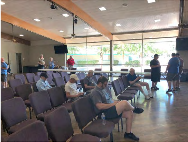
We know it was already 100° outside at 10:00 AM but it was still a smaller crowd than normal even for June