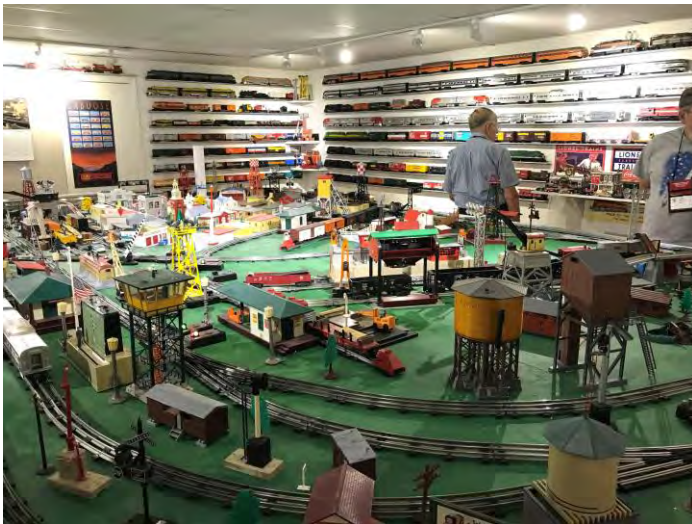
Ken Miles had a little bit of everything for the collectors and the operators