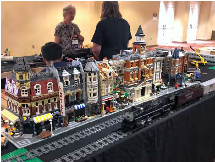
A great LEGO layout with a scratch built replica of the AT&SF 2926