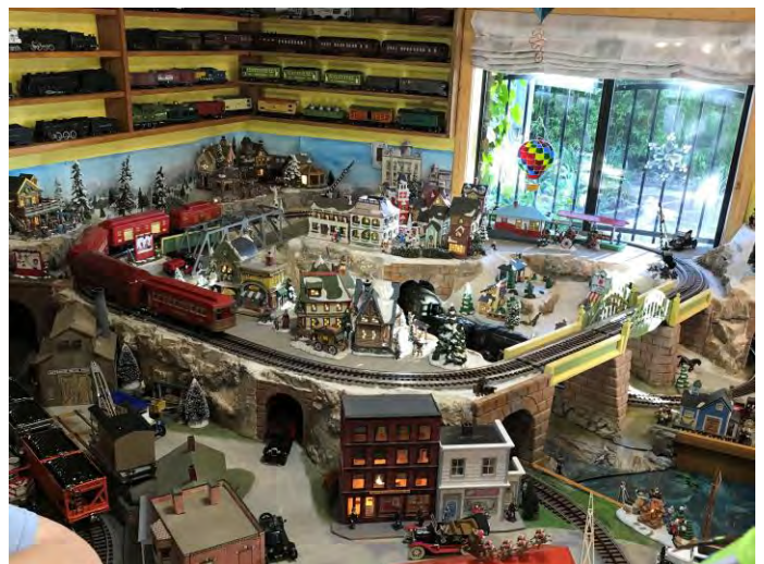
A view of Scott Eckstein's Standard Gauge layout in another part of his train room