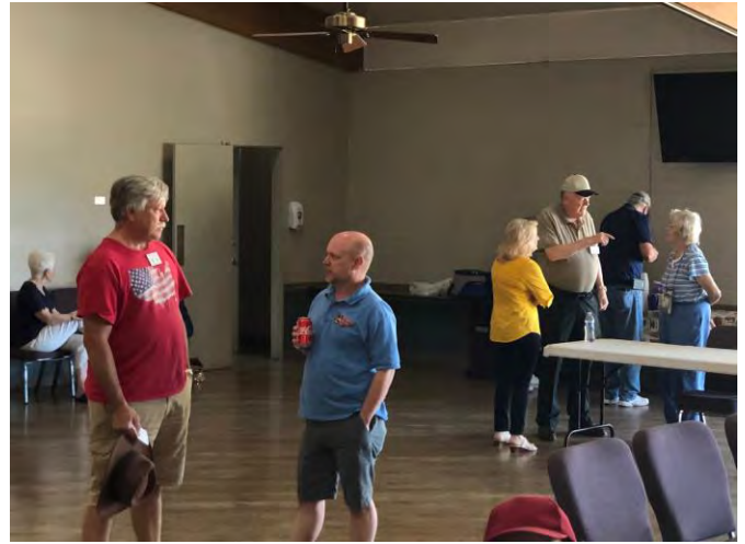
With so few table sellers, folks just got caught up on the latest news or talking about their summer plans