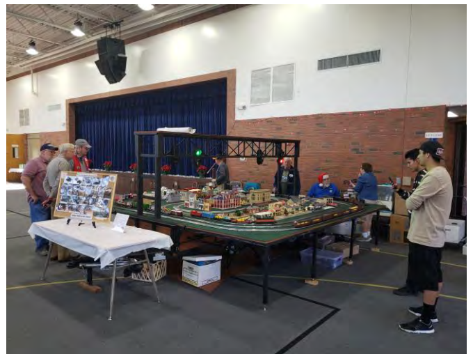
All setup and waiting for the party to begin with some of the other church volunteers looking on