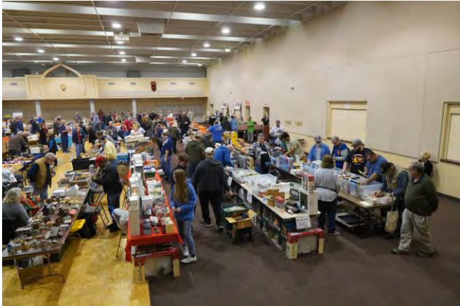
We didn't get a panoramic view of the entire hall this year but you can see it opened up with nice crowd