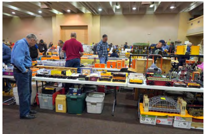
A different view of the hall. This photo is taken from the main entrance just past the admission table