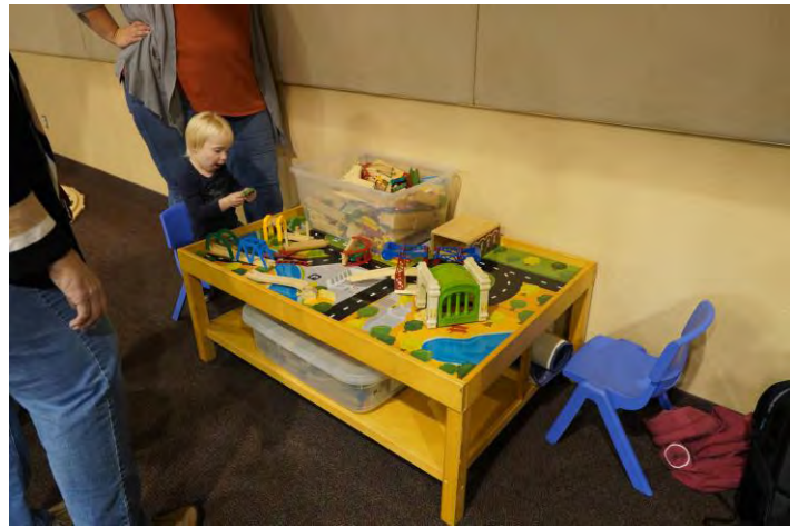
A last-minute addition will be back next year. We had a small children's area filled with coloring sheets, free crayons, the Brio table and even a ride on train