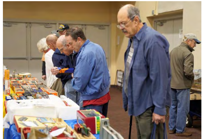
Nice row of shoppers checking out everything from LGB to HO with a nice table of Lionel in between. The show had a little bit of everything