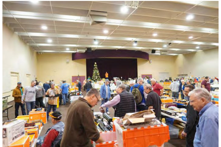
View looking to the front of the Shrine Auditorium found full aisles of shoppers