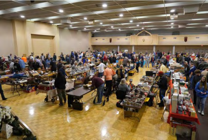
The Shriners Hall filled up quickly and stayed busy throughout the morning