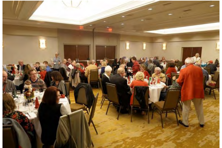
One view of the room as the guests arrived for the Christmas Holiday Party. Since it was a plated dinner there were no “jinxed” tables.