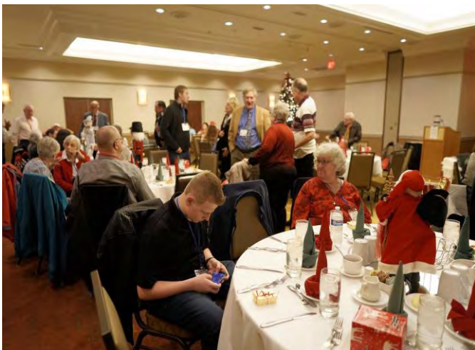
As we waited for the last of the guests to arrive many members mingled with friends and shared stories of the past few weeks. With three clubs sharing the evening, nobody was a stranger