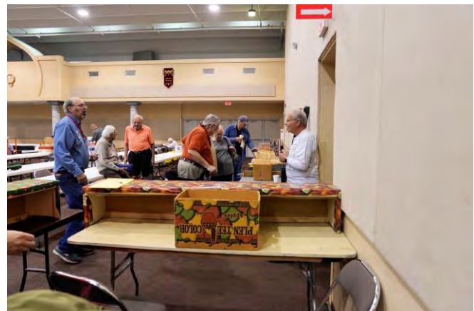
With the front end closed, a small crowd gathers to preview the items for the table top auction at the end of the show.