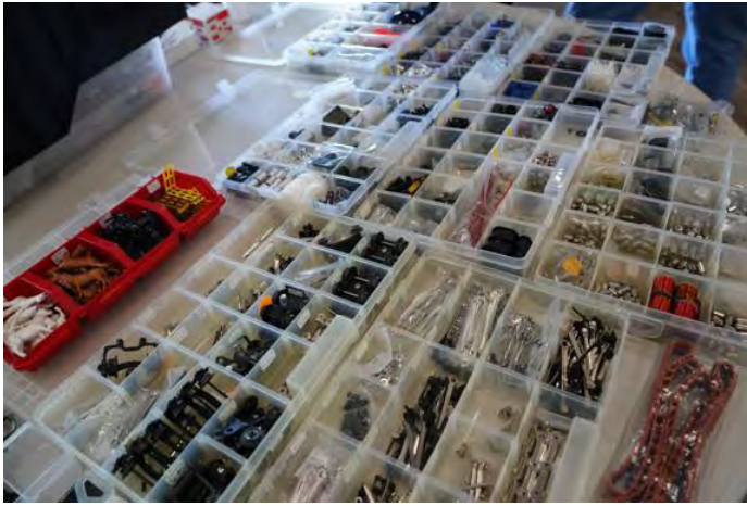
Yes, DeLon was at the meet and setup for your parts need. We won't see him again until the fall