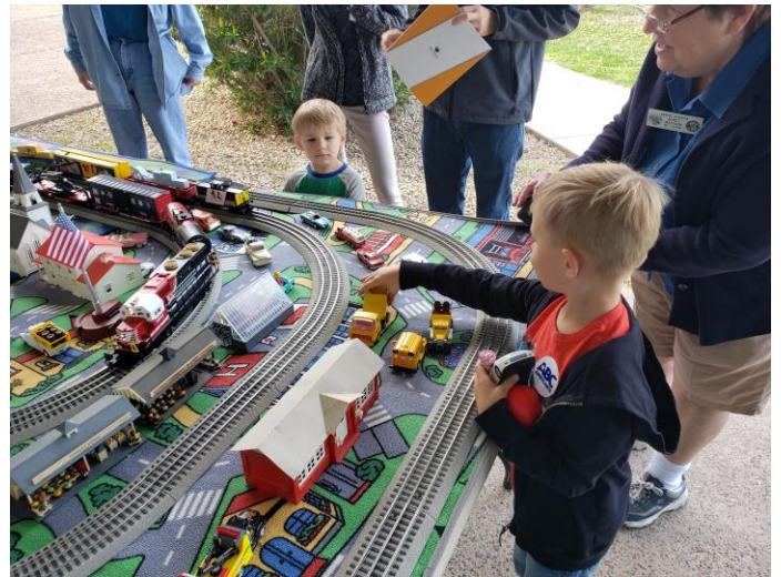
Hard to resist reaching for all those trucks and cars we had on "display"