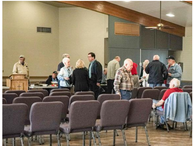
Early arrivals grabbed a donut some coffee and caught up on the latest news from friends