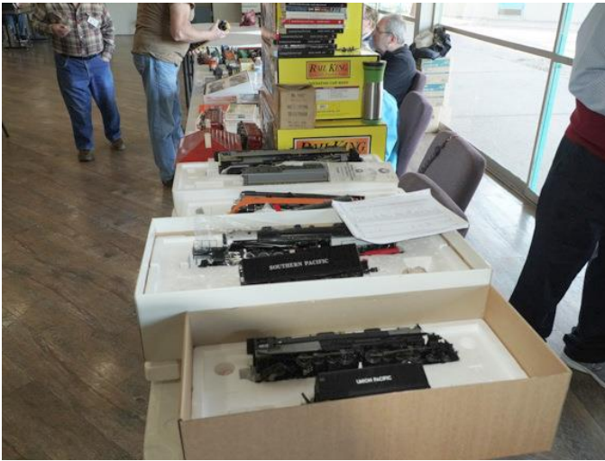
Quite a lineup of steam locomotives for sale