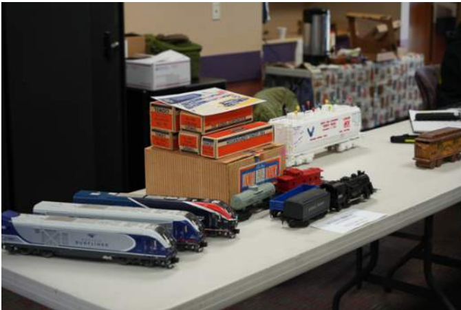
A table full of interesting items for the educational segment.