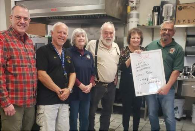
Many thanks to the cooks who created all the wonderful soups for the auction!