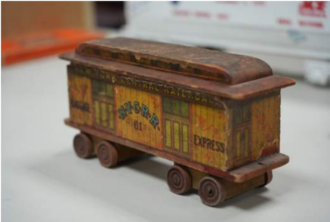
An R. Bliss Wooden Pull Train from Circa 1880!