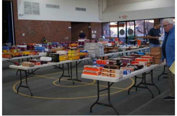
Lots of trains for sale!