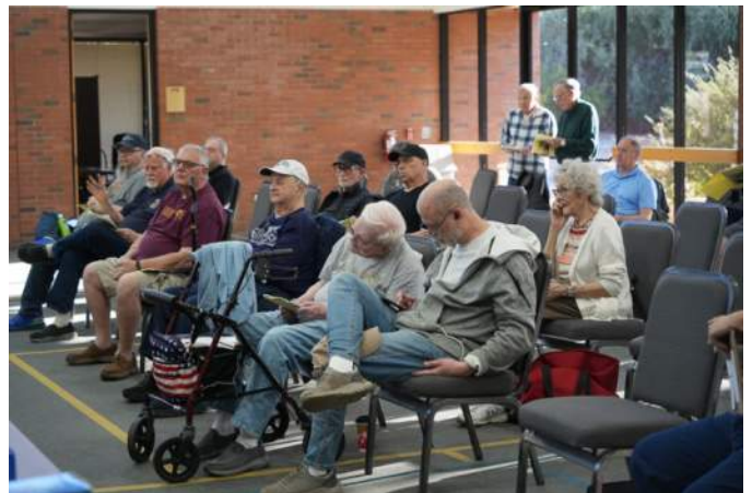
A good crowd of bidders.