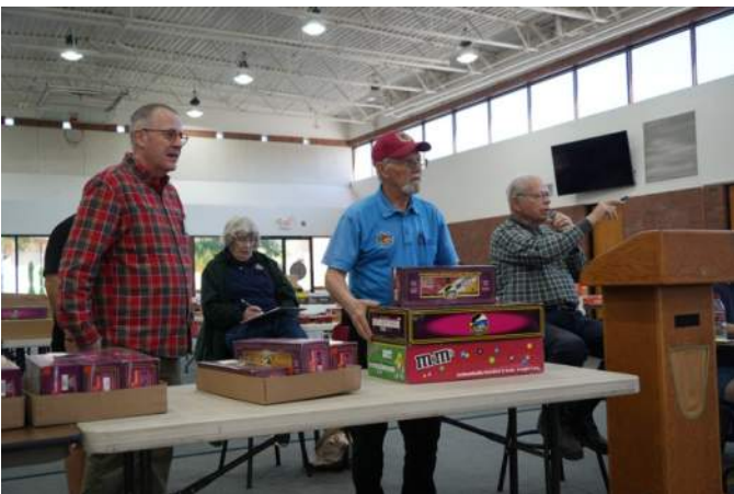
Bidding got interesting on several items.