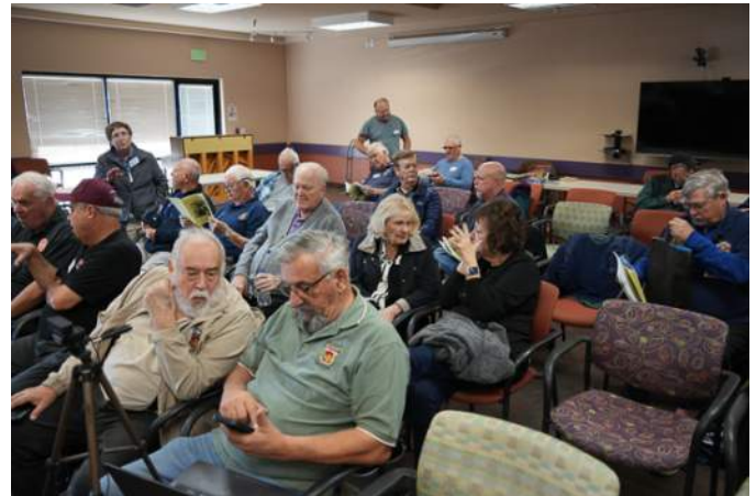
A well-attended January meet!