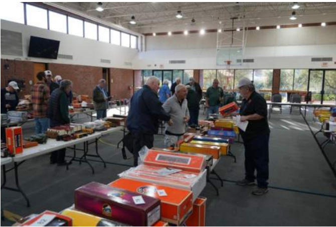
A hall full of trains of all eras ready for auction.