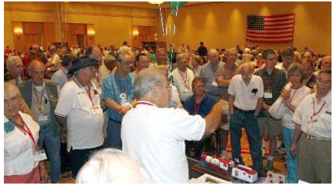
The Welcome Party live auction drew a huge, enthusiastic crowd.