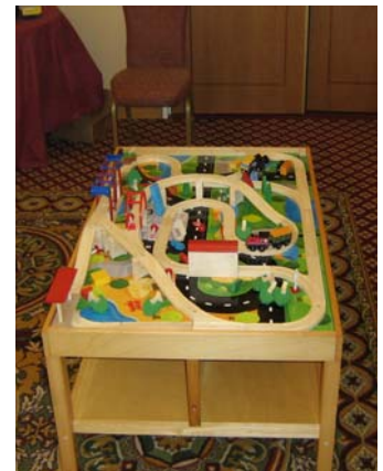
Brios for the youngest fans.