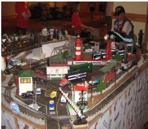
Jon Sprago at the Albuquerque Kids layout.

A big plus for our Kids Club efforts was that we signed up as members two families. Seems they were so impressed with our kid's club activities, they joined immediately.