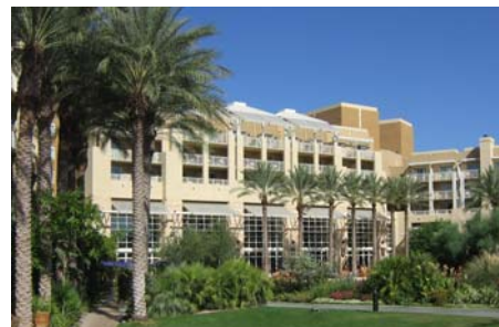
J. W. Marriott Desert Ridge Resort and Spa, as seen from the Lazy River.

The Welcome Party featured nearly as many silent auction items for the spouse or family member as it did for the TCA member. There were docents and DVD's on every tour, no matter how long or short. In lieu of a riverboat trip, we treated our group of merry makers to a Southwestern Fiesta – a sumptuous repast of American and Mexican food followed by a combination American/Mexican Rodeo, while a Mariachi band entertained the crowd.