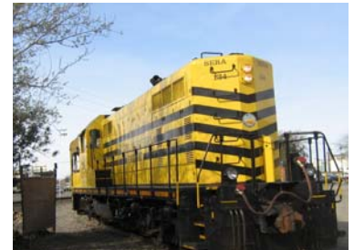
Sacramento River Dinner Train