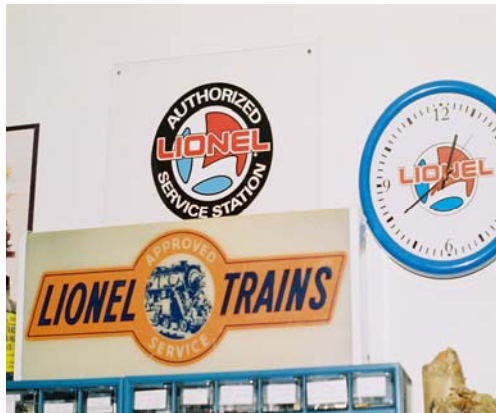
Some of Greg Palmer's Service Station Signs