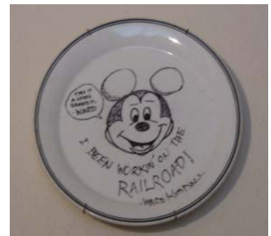
My last acquisition at the Cal-Stewart Meet, a Ward Kimball drawing on a dinner plate.

I bought a fair amount of things at this meet, but nothing can compare to my last purchase. As always, it was a fun meet with a really great Saturday night banquet, filled with many silent auction prizes, of which I won two. Perhaps now that the Turkey Meet is going to be a two-day affair, we might be able to consider a banquet after the Saturday meet. Just a thought . . . Once upon a time it was a “thought” with Nor-Cal and now it is a successful reality.