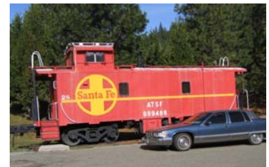
Caboose #28 in Dunsmuir