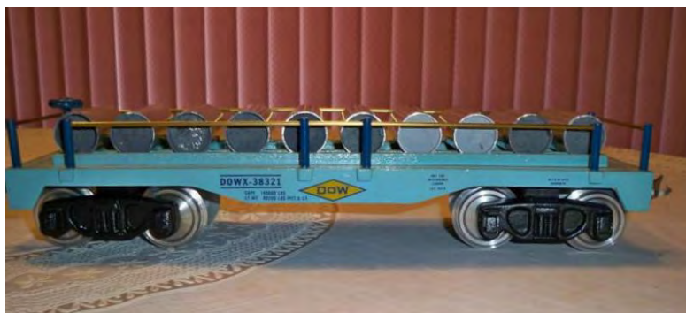
Two fine examples of Glenn Toy Train craftsmanship