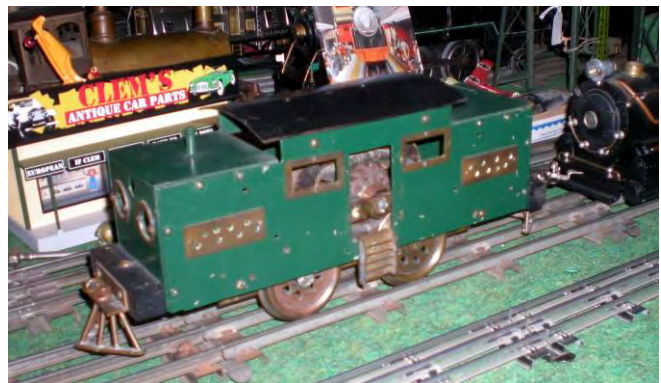
No story about Clem would be complete without a mention of STOMPER. It is rumored the heart of the homemade beast is a vacuum cleaner motor...