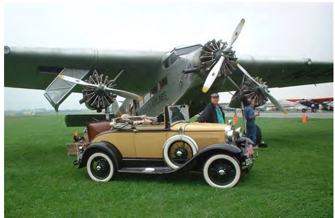
How do you combine your love of toy trains, vintage cars, and aircraft? Quite easily if you ask Clem!