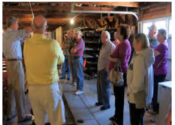
A rare behind the scenes look at the McCormick-Stillman Railroad Park workshop