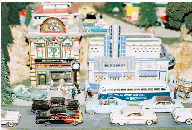
Just one small scene from David's layout visitation