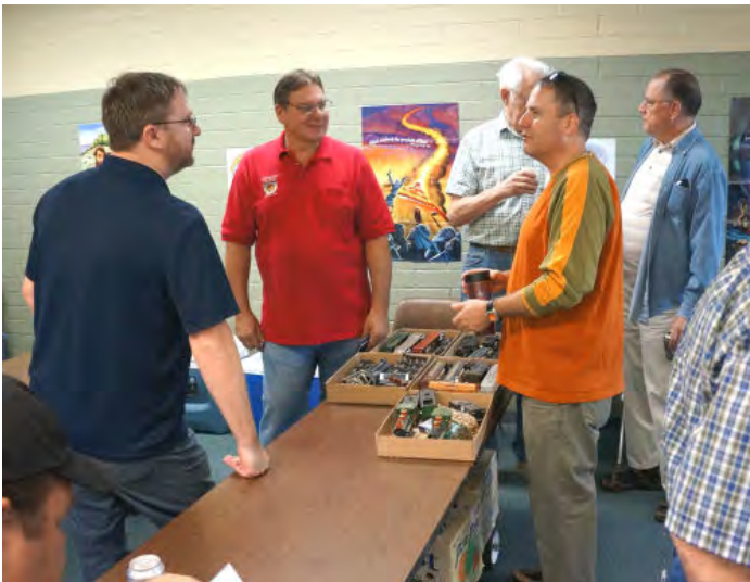
Hard to tell if we are selling trains or having a good time. Probably a little of both.