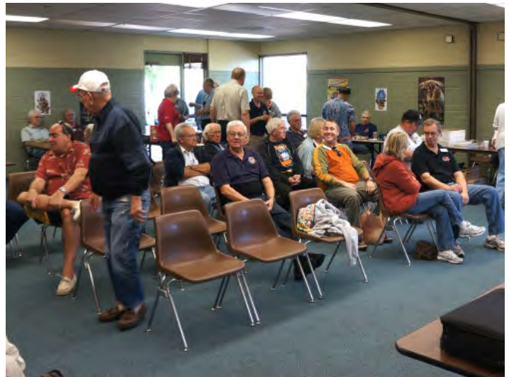
The November mini-meet was a last minute decision and the regular meeting room was already booked, but those who came out still had a great day.