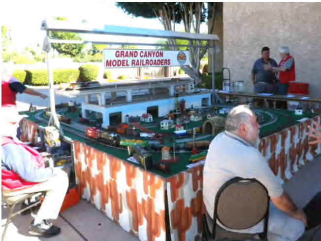
The GCMR module running trains all day