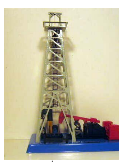
3<sup>rd</sup> Prize Lionel #6-12930 "Lionelville" Oil Derrick