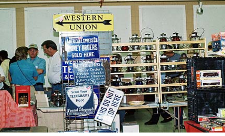
Set made an appearance.