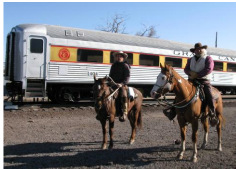
Left: BNSF diesel on display Center: The "cowboys" await the departure of the "Day Train." Left: It was a "beary" good time at National Train Day 2011, with visits from the Bearizona Bear and Smoky the Bear.