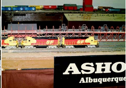
After Meet Activity was a tour of the Albuquerque Society of HO Module Engineers setup and layout.