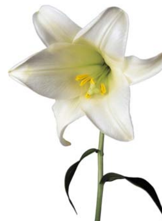
TOM STANGE 9/24/1946 – 2/27/2010