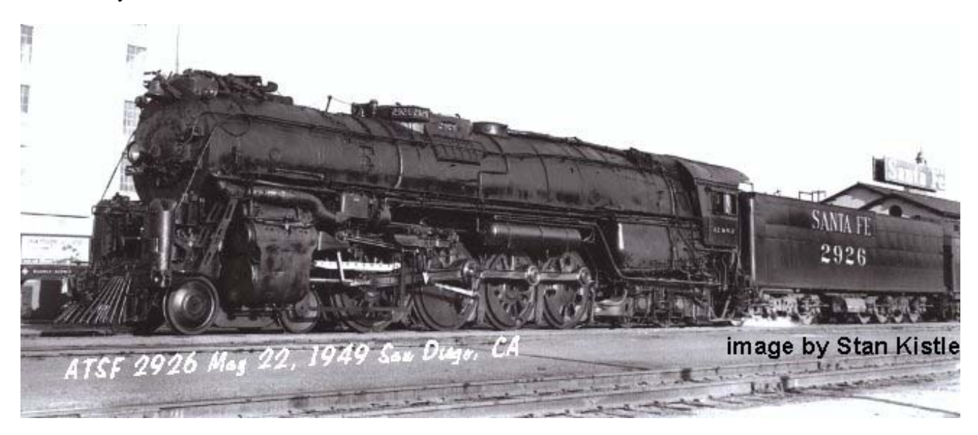
ATSF #2926 in better times

This will be a Rio Grande Chapter Meet you should not miss. The Meet will be held at the Sombra Del Monte Church – Lohmann Hall, at 2528 Utah N.E., Albuquerque, NM at 10:00 AM. Members please note that we are having the Meet back in Lohmann Hall, so enter the Hall off of Utah Street. This will be a great Meet, so don't miss it. See you there.