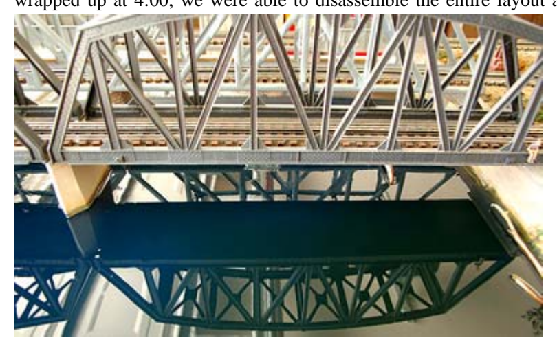
The newly restored river on a nearly 20 year old bridge module.

For the third time in less than a year, the TCA had a successful run of the modules. This time we were at the 3R's event at Falcon Field on April 25. The name unfortunately did not stand for three rails, but instead stood for Roads, Rails and Runways. Unlike previous times there, it was a promotional event for the airport and run by the city of Mesa. Highlights included a classic car show, a display of RC aircraft, flights on the Commemorative Air Force's B17 and B25 bombers and most importantly operating train layouts by both the AZBTO and the TCA. The TCA layout ran flawlessly and continuously the entire day in a 12'x24' configuration and included some new features such as a lift bridge module to access the center of the modules, a newly restored 2'x8' bridge module with simulated water and Gar Graves track, and finally some more detail to the "sky" boards. With the exception of the corners, all of these modules are in addition to the ones operated at Rail Fair last October so we can expect a 12'x32' operating layout for the convention! When the event wrapped up at 4:00, we were able to disassemble the entire layout and pack it into the back of a Suburban and small