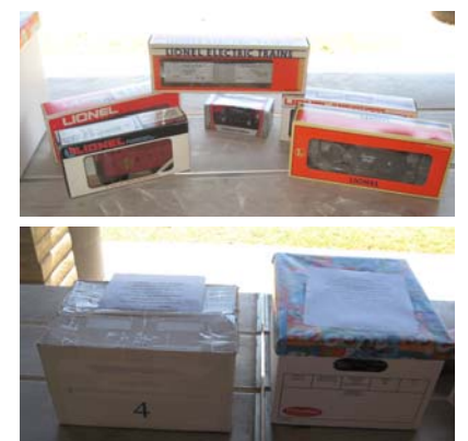
Raffle Prizes and Mystery Boxes