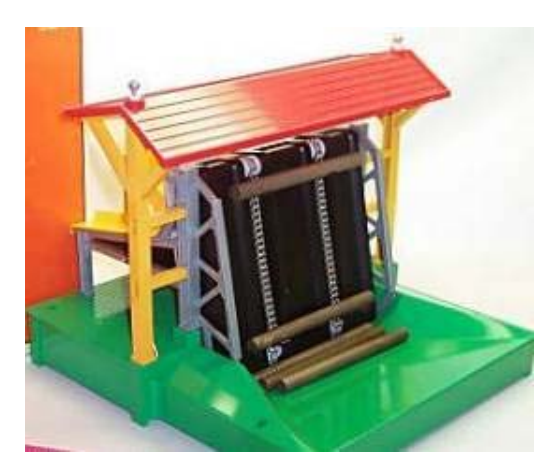
2<sup>nd</sup> Prize Lionel 6-12915 #164 - Log Loader

No. 1976 "Spirit of 76" Lionel Diesel No. 1975 Pullman car AMERICAN EAGLE No. 1974 Pullman car STARS & STRIPES No. 1973 Observation car FREEDOM BELL