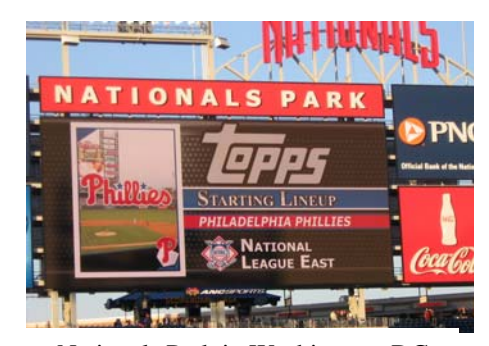
Nationals Park in Washington, DC