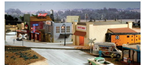
Main Street, Ash Fork