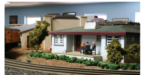
Good times on the back porch watching trains go by.