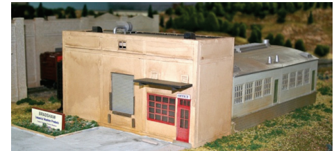
Hangers for industrial-looking structures