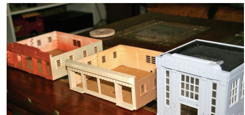
Plasticville stores extended and repainted.