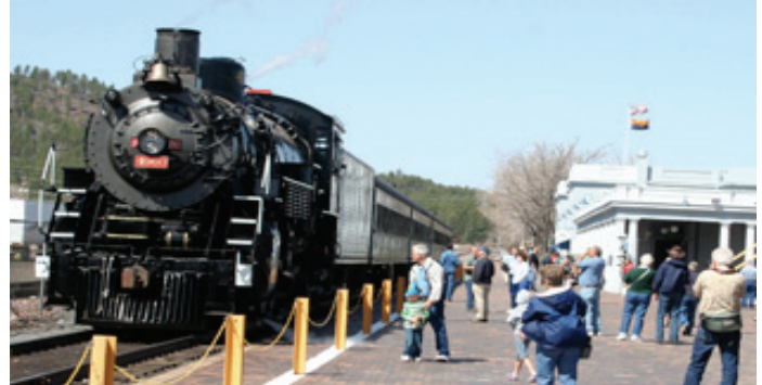
On the depot platform, awaiting departure of the Cataract Creek Express

The highlight of the weekend will be the ability to take a trip aboard the Cataract Creek Rambler on a historic Harriman coach car behind the GCR's largest steam engine, #4960. The 45 minute trip will run hourly during the weekend from 10AM until 4PM. Tickets are $15 for adults, $10 for children, and may be purchased at the depot either day. Also, for a $5 donation to the NRHS, folks will be able to have a conducted tour of the Grand Canyon Railway's locomotive and car shop facilities. (Please note: shop visitors must be wearing sturdy footwear and no open toed shoes.) Other than the train rides, all events are free.