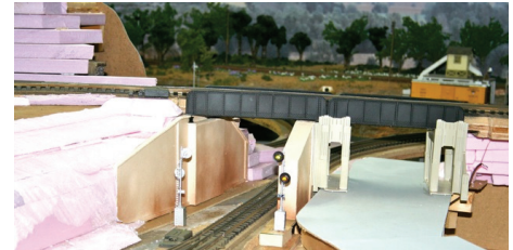
Scenery under way, with pink foam