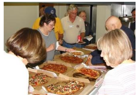
Everyone enjoys Pizza.