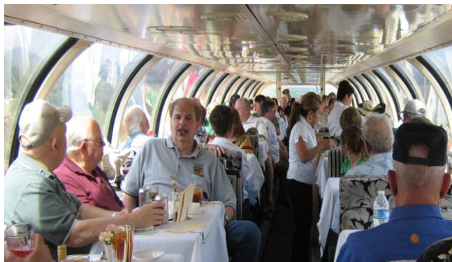
Dining in the Dome Car