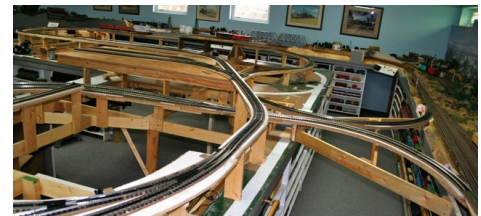
Benchwork extending onto the old layout

A video of the new town is at: www.youtube.com/watch?v=yD8yAwl3h1A&feature=channel_video_title . And of course, you can see it live when you join us at the “Beat the Heat” meet come August 20, 2011.