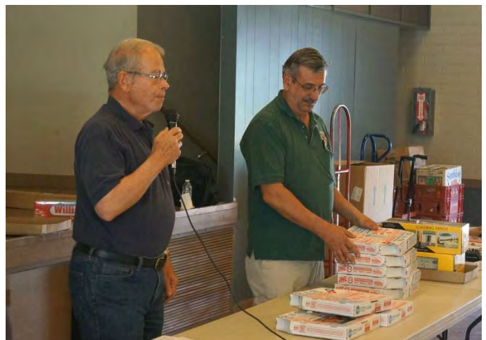
The first thing we auction off? Pizzas of course!