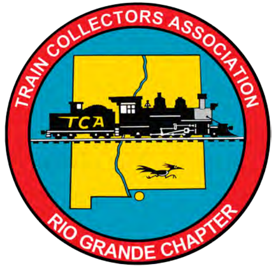
This is the winning logo voted on by the members of the Rio Grande Chapter