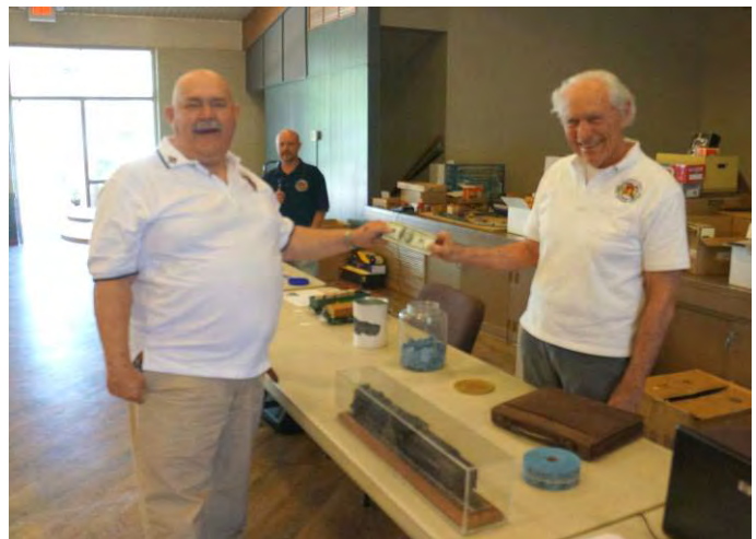
The master prognosticator himself and we thought all he knew how to do was grill hot dogs