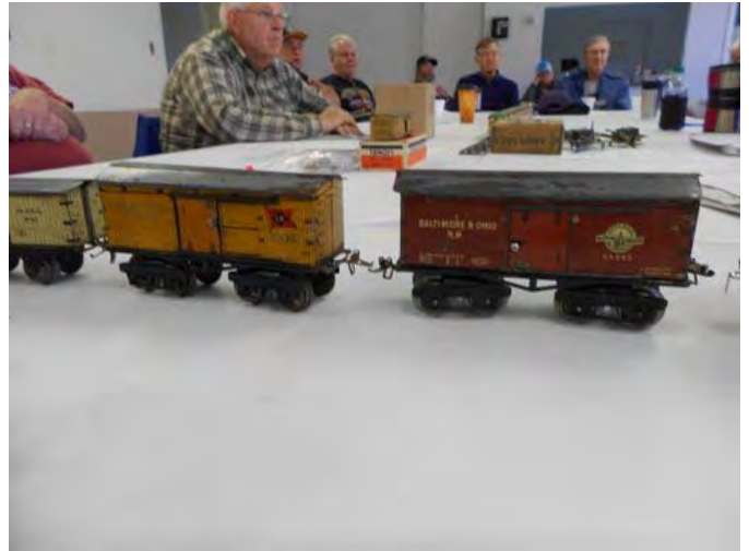
Greg also brought in several other cars including these nice IVES 8 wheel boxcars from the 1920's