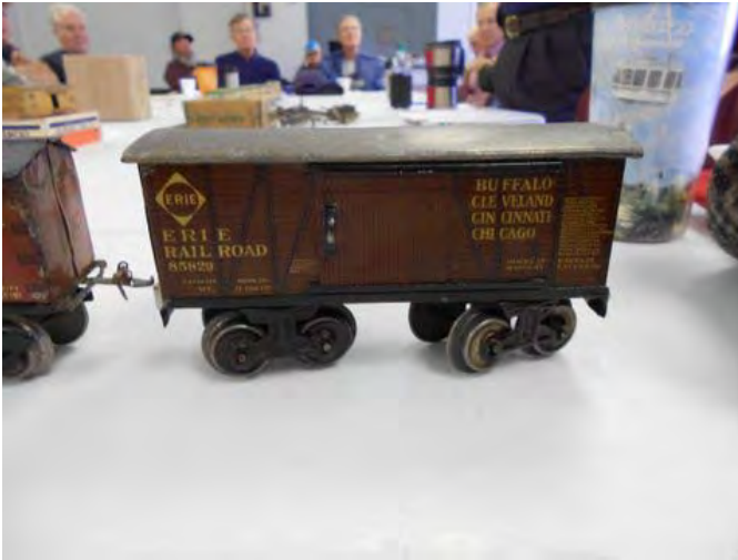
Rio Grande Chapter President brought in several nice prewar trains, here is a Bing Boxcar from 1913