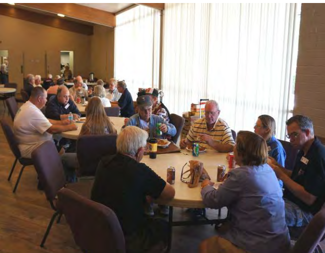
Happy Pizza Meetza eaters!