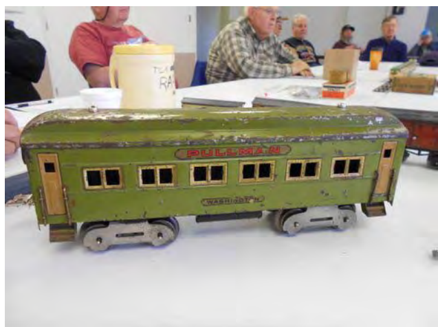
Greg Palmer's Dorfan standard gauge passenger car