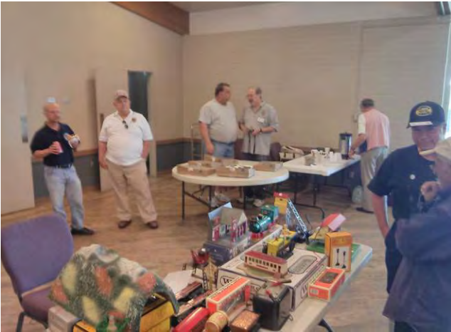
Even the hospitality table was commandeered as a sales table