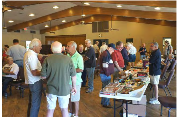
Great turnout for the meet and auction or was it for all the free pizza you could eat?