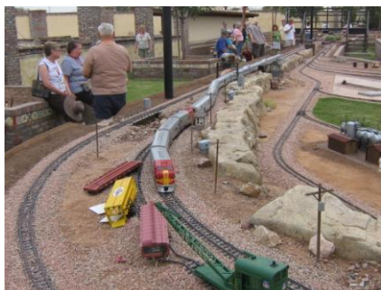
Garden Railroad Layout Tour