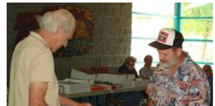
L: An eager crowd awaits the beginning of the Meet.