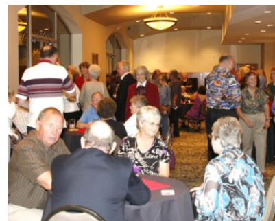
Celebrations with fellow TCA'ers