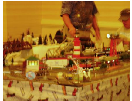
John Spargo's layout always draws a crowd of children of all ages.