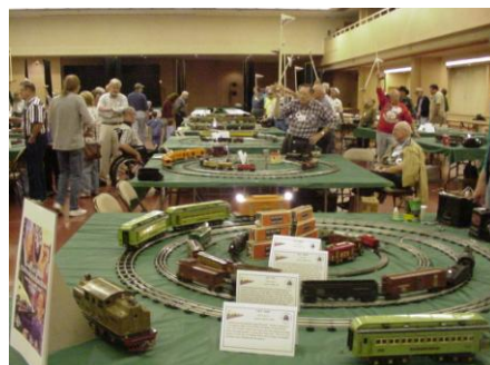
Lionel 100 th Anniversary