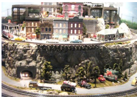
Jam-packed Layouts in tiny spaces