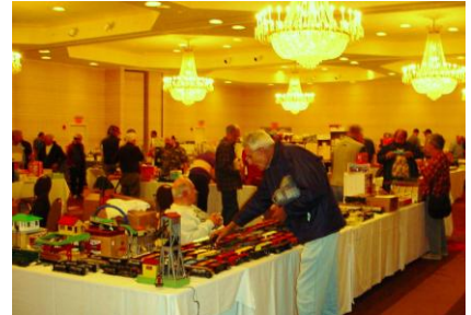
The hall was filled with tables which were filled with toy train sale items.