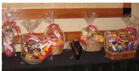
Just a few of the 16 Door Prize baskets.