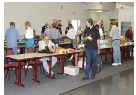
The well-attended meet had items for everyone, from raffle tickets to trains to stories to camaraderie. This was our last meet at the Jaycees Hall.