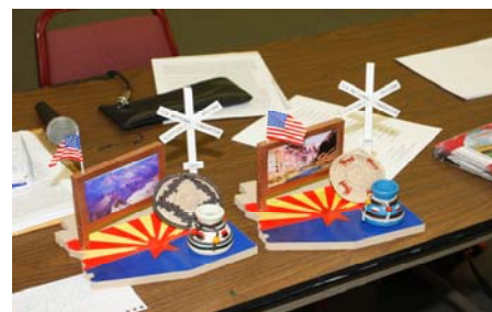
Top to bottom: Tom Stange's truly "RARE" Lehigh Valley caboose from the Convention. Greg Palmer's telegraph keys and radio telegraph telephone coil. Bob Herman's Convention Banquet table centerpieces.