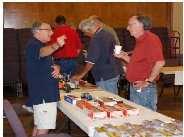
Is it a sale or just a how'd ya do?