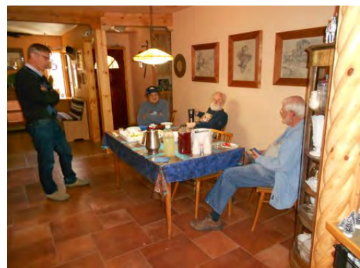
Light refreshments encouraged more fellowship at the Eckstein's