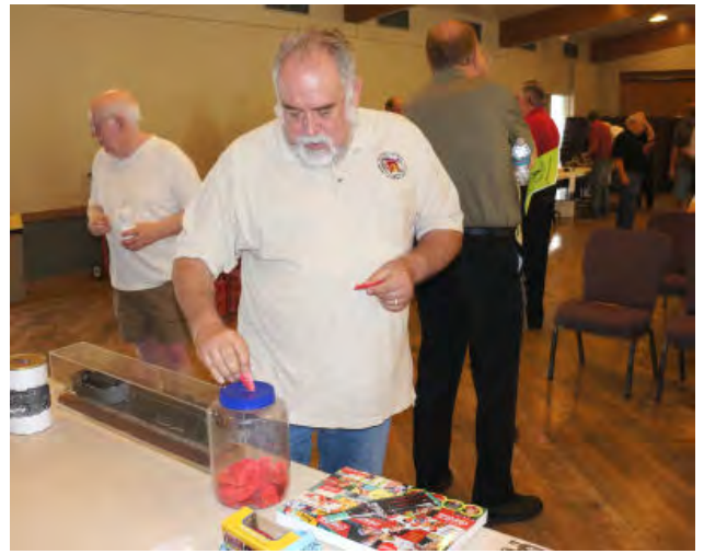
Mystery solved! The "no name" ticket buyer caught in the act...