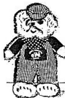
Cub-Boose Kids Club Mascot

Kids Club is currently selling Polar Express raffle tickets (through December 11). We request that each member invest in at least a minimum single ticket for $2.00; but 3 for $5.00 is better. Hope to see each of you at the Meet on September 10, 2005.