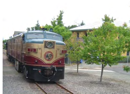
Ride through Napa Valley on the Wine Train.

Then, just about 15 miles to the North east is another tour you could have taken as part of this well conceived convention. The Napa Valley Wine Train, in Napa City is only a 30 minute ride away from the Jelly Belly Factory. You can have your choice of riding and eating in a classic Dining Car from the 1920's or a more modern Full Length Dome Car from the 1950's. The food is gourmet and the service is exquisite – comparable to that of the fabled Orient Express. I make that comparison, because Christie and I have been on both trains and agree that the food and service on the Wine Train is equal to the Orient Express. The Wine Train travels from Napa City to St. Helena, CA. and back, past many famous vineyards and at a pace that allows you to savor every moment of the trip. It is a first class experience every minute of the trip.