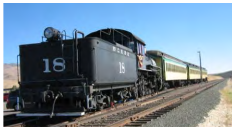
Engine 18 goes from Carson City to Virginia City.