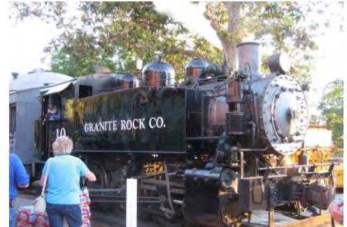
A special treat at the Welcome Party was a train ride along the Sacramento River.