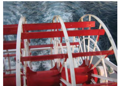
A vintage paddlewheeler plies Lake Tahoe during the evening Dinner Cruise.