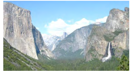
Panoramic view of Yosemite Valley

Sunday morning an intrepid group of Conventioneers boarded buses in Sacramento for a trip to one of America's most incredibly beautiful and visited National Parks, Yosemite National Park. Calendars and place mats across this nation are festooned with photos of the vistas from this favorite place of John Muir's. Because of an inordinate amount of snow and rain this year, the waterfalls are flowing at a rate not seen in more than a century, so we were to be treated to some incredible scenery. Many members availed themselves of a guided two hour narrated tram tour which highlighted all of the most important sites within this fantastic valley.