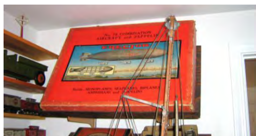
The Dirigible Box, artfully displayed.

A very unique Layout Tour was provided for members of this convention, one which had I been a neophyte in this hobby, would easily have steered me into collecting/operating trains of the era before WW II. The combined collections of Clyde Easterly, Chuck Stone, and Chuck Brasher were beyond amazing; they were Spectacular! Phenomenal! Magnificent! Impressive! It wouldn't matter what adjective you placed here, it wouldn't adequately describe what you were seeing. Suffice it to say, "WORLD CLASS" would barely cover the term for their three fold collections in Grass Valley.