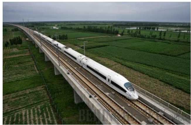
The route between the two cities of Beijing and Tianjin is almost a straight line to allow for the high speeds