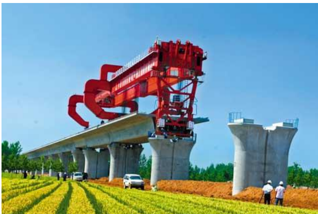
Here you can see the minimal impact the viaducts have on land use and eliminate at grade crossings

This 73 mile intercity express line between two of the largest cities in northern China has slashed the travel time from 70 minutes to 30. It is also listed as the “World’s Fastest Railway.” The system was engineered for routine travel of 215 mph and top speeds in excess of 235 mph with over 85% of the tracks laid on viaducts. Chinese builders used these elevated lines to keep high-speed rail tracks straight and level over uneven terrain, to save on land acquisition costs, and to minimize impact on local communities. Because of the use of these elevated sections, this Railway also has the distinction of having one of the top fifteen longest bridge in the world. The Yangcun Bridge is listed as being 35,812 meters long (including its entry and exit ramps) which would be over 22 miles long. On June 24, 2008 a Chinese conventional-wheeled train speed record was set on the line when a China Railways CRH3 train reached 394.3 km/h (245 mph). France currently holds the conventional rail record with a modified TGV POS V150 trainset running for testing purposes only of 574.8 km/h or 357 mph. The speed record for all railed vehicles is 10,325 km/h (6,416 mph) by an unmanned rocket sled by the United States Air Force. (source Wikipedia)