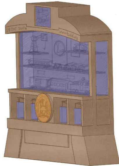
Artist rendition of a possible display case for the Railroad Park