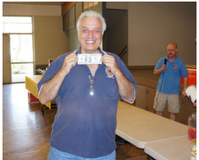
Guess who won the $100 Hudson drawing?