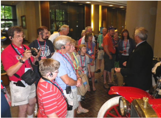
Tour at Chick-fil-A headquarters

Mother Nature sure threw a curve ball at everyone this summer as a record heat wave swept through much of the country. Atlanta was no exception and except for the humidity we felt right at home enjoying some fabulous tours, friends, and of course food. This was my first trip to Atlanta and I enjoyed all the southern hospitality from the moment I landed. Atlanta is the corporate home to many large companies and Dixie Division had numerous sponsors who stepped up and made us all feel welcome. A big tip of the hat to Chick-fil-A, for their denotation of a tasty breakfast sandwich for those leaving on the very early morning tours. The week went by very fast and many tours were so enjoyable we forgot to unpack the camera and take pictures we were having such a great time. The next TCA convention will be almost smack dab in the middle of the country in St. Louis, Missouri, so make your plans now to spend your summer vacation with 700 of your closest friends. You'll be glad you did.