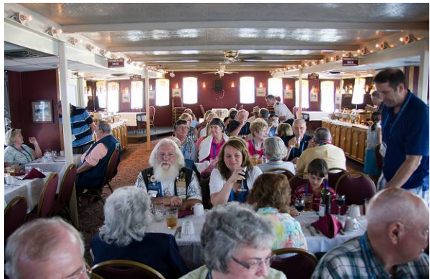
Hard to tell in this photo but there are eight Desert Division members here enjoying the dinner cruise